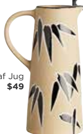
Leaf Jug $49