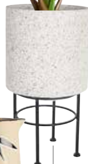
Eden Faux Potted Fan Palm $89 Terrazzo Look Planter from $49