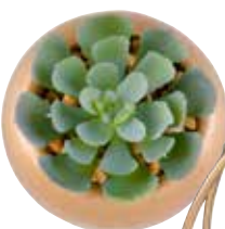
Floret Cactus Plant $6

Crafted from sustainably sourced acacia timber over a steel frame, the robust castor wheels allow you to glide the table into the sunny spot on the deck (or out of the rain) with ease.