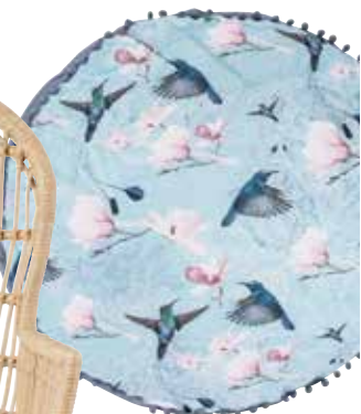
Cervino Flight 60cm Cushion $59