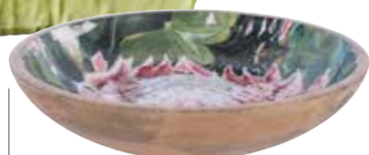
Eco Sole Australian Native Bowl $89