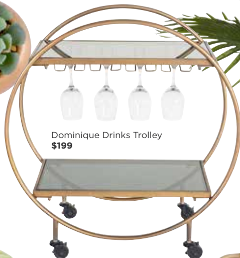
Dominique Drinks Trolley $199