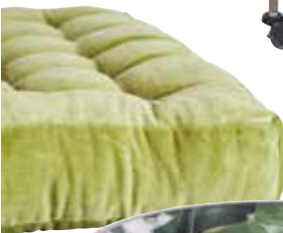
Samy Leaf Green Seat Cushion $29