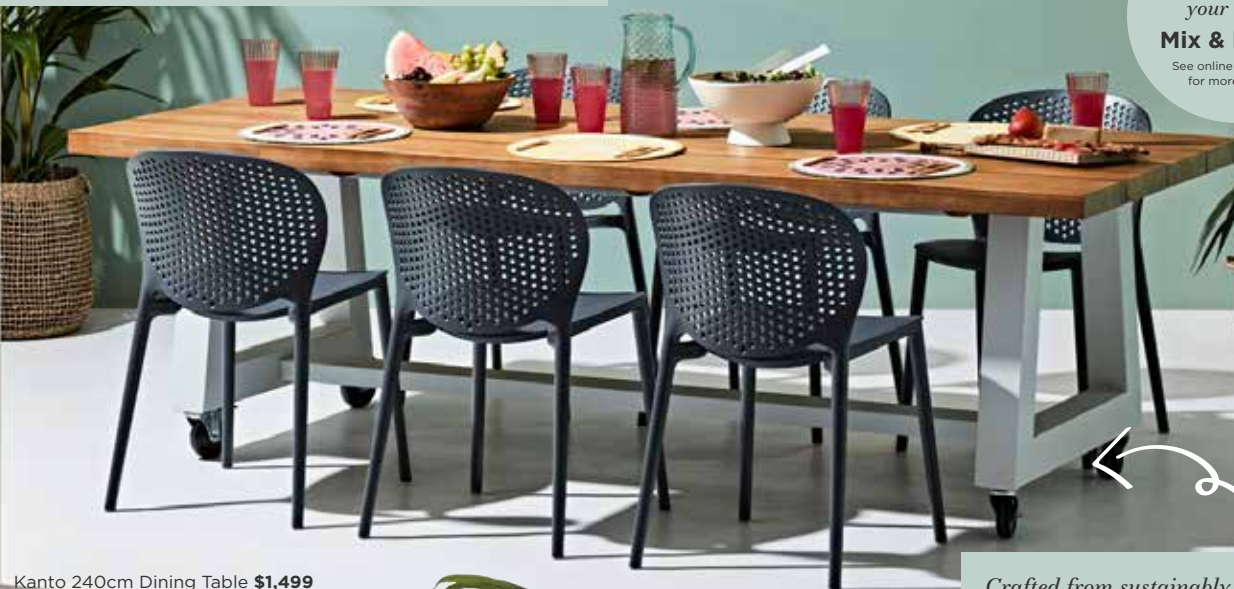
Kanto 240cm Dining Table $1,499 Cate Basalt Dining Chairs $129ea 7 Piece Package Price $1,699

Crafted from sustainably sourced acacia timber over a steel frame, the robust castor wheels allow you to glide the table into the sunny spot on the deck (or out of the rain) with ease.