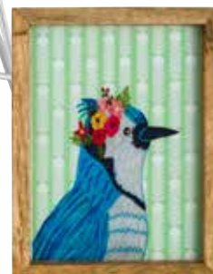
Stitch Blue Bird Wall Hanging $39