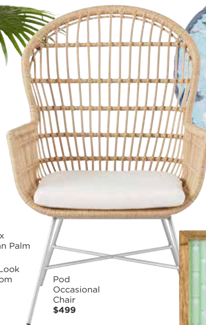
Pod Occasional Chair $499