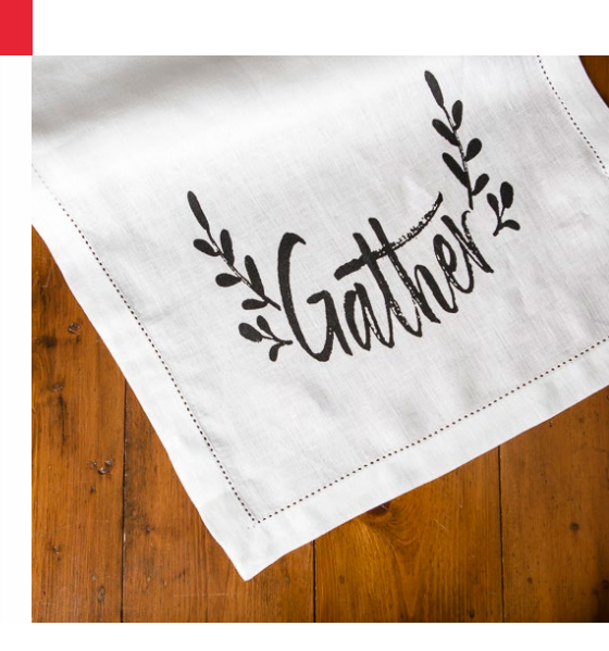
$45 | Well Versed Homes Gather table runner