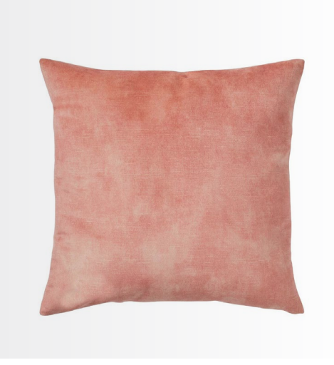
$55.95 | Weave Home Ava soft touch cushion