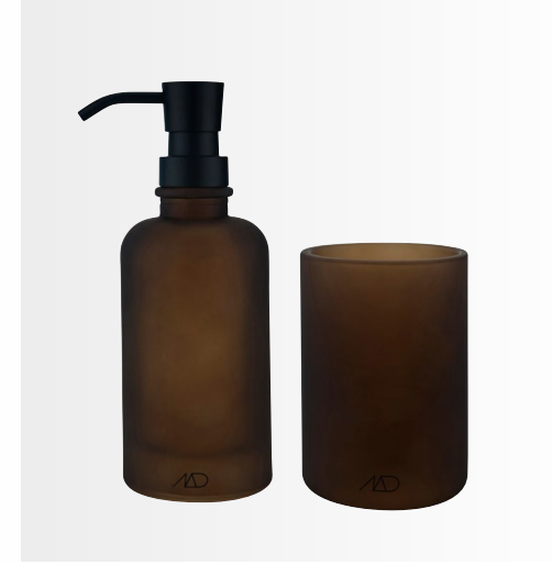
From $36 | Oliver Thom Mette Ditmer soap dispenser & tumbler set