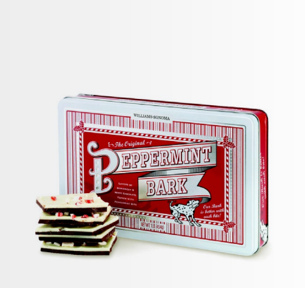
$44 | Williams Sonoma The Original Peppermint Bark