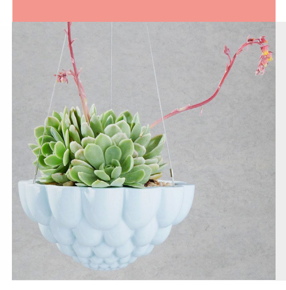
$69 | Angus & Celeste Round jelly planter