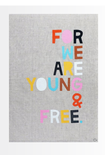
$89 | Castle Art teatowel