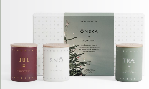
$89.95 | Oliver Thom Skandinavisk ÖNSKA Mini Candle Set