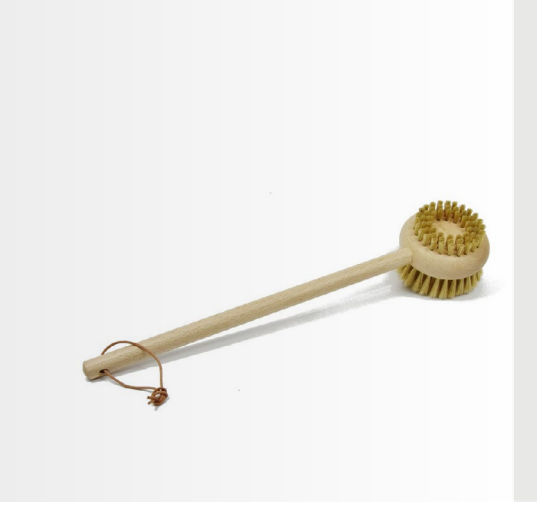
$45 | Oliver Thom Andree Jardin Bath Brush