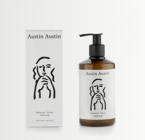
$43 | Oliver Thom Austin Austin Hand Soap