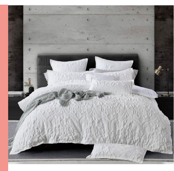
$149.95 | Manchester Collection Amari quilt cover se