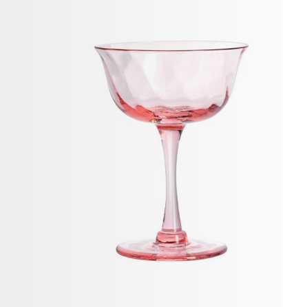
$69 | Pottery Barn Monique Lhuillier Clare Champagne Coupes (4)