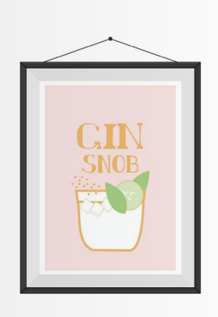
$17.95 | Kookery Gin Snob art print