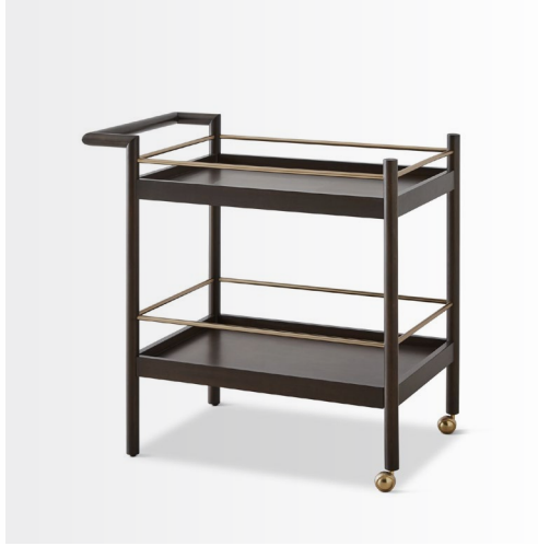
$599 | west elm Mid-Century Bar Cart