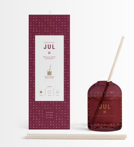
$89.95 | Oliver Thom Skandinavisk Jul Diffuser