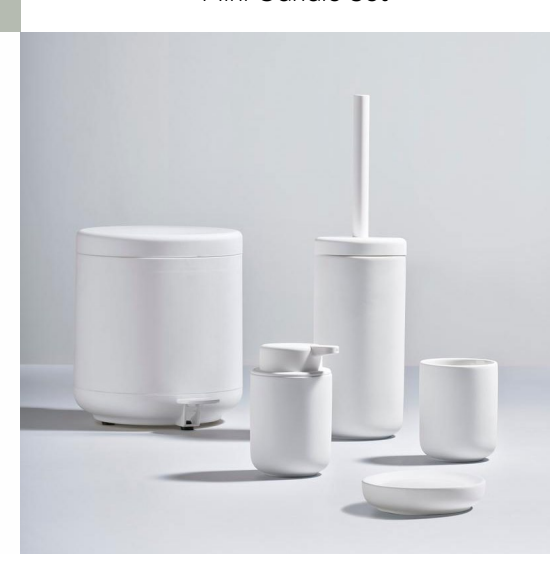
From $40 | Oliver Thom Zone Ume bathroom set