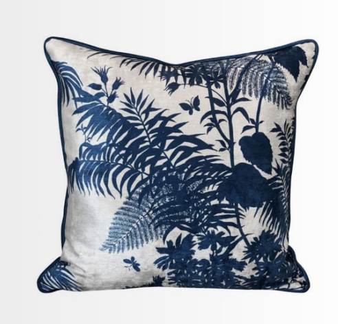
$135 | Florence Broadhurst Fabrics Euro velvet cushion cover