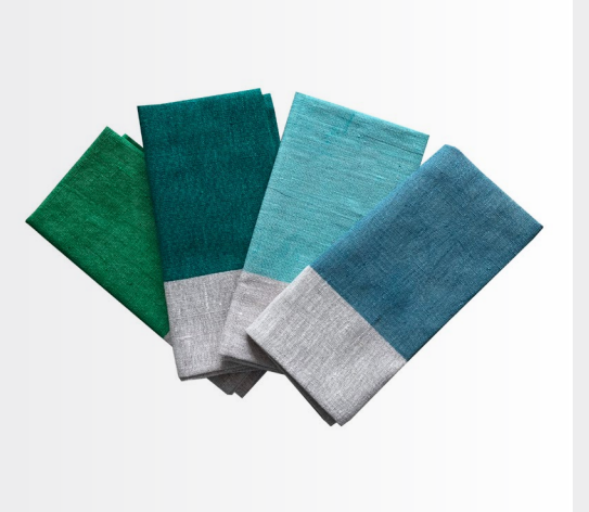
$64 | Aqua Door Designs Shades of green linen napkins (4)