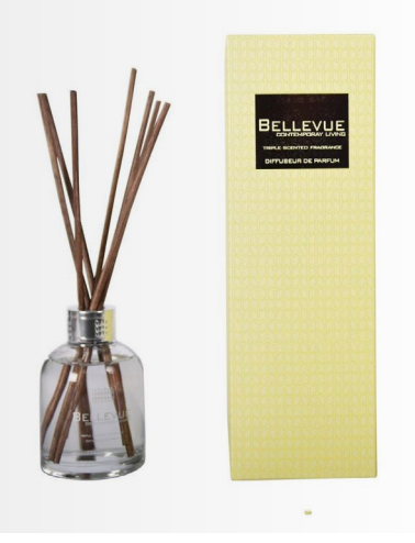
$14.95 | Manchester Collection Triple scented room diffusers