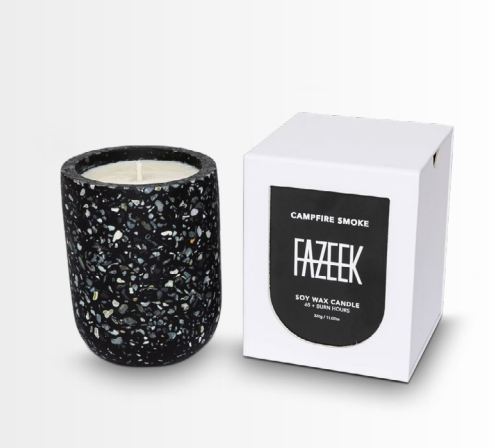
$69 | Oliver Thom Fazeek Campfire Smoke Candle