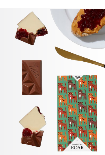
From $4 | Hey Tiger Ethical chocolate