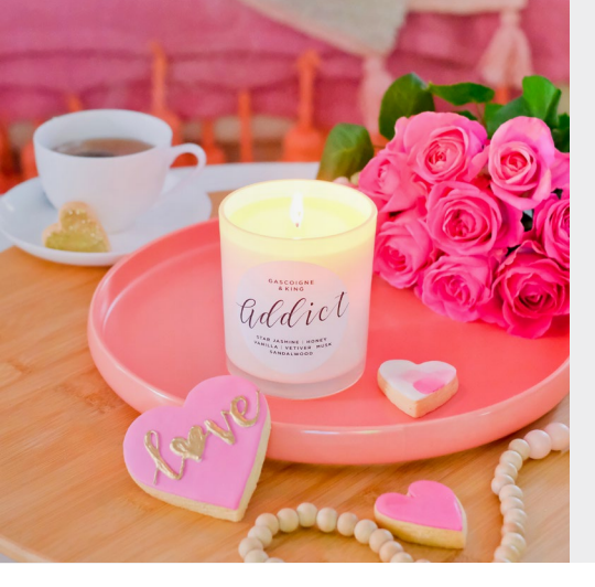
$55 | Gascoigne & King Interiors Addict candle