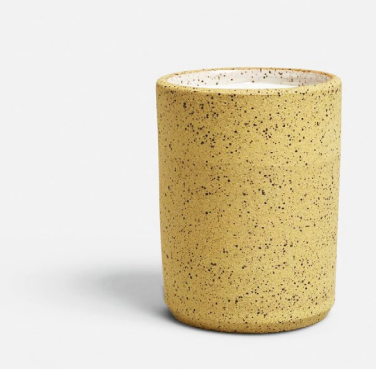
$79 | Oliver Thom Norden Joshua Tree Ceramic Candle